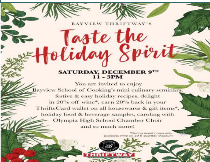
Bayview Thriftway rings in the holiday season with the "Taste the Holiday Spirit" event! Their cooking school offers mini culinary seminars with festive and easy holiday recipes to learn plus caroling with the Olympia High School Chamber choir. What a great way to start the holidays and share the holiday spirit!