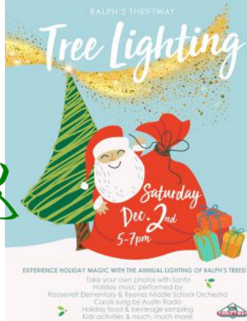
Ralph's Thriftway does a GREAT job celebrating the holiday season with their annual tree lighting event! They have free photos with Santa, holiday food & beverage sampling,, Caroling, and even the community gets involved by inviting the local elementary & middle school orchestras to perform! Everyone has a great time and it has become tradition in the community! CONGRATULATIONS on another successful holiday year!